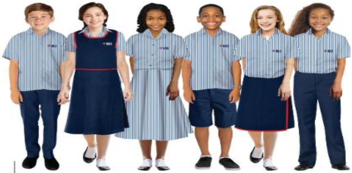
Year 1 - Year 6